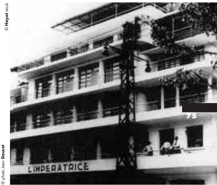
Fig. 9. L'Impératrice Hotel, 1955

The exhibition entrance's striking feature is a monumental modernist front gate, no doubt influenced by the aesthetics of the 1925 Arts décoratifs World Fair (fig. 5). Architect Robert Haller is the author of the exhibition's layout and of the 15-meter high fountain of light also set up at Terres-Sainville: "The waterfall takes place from the top down in successive cascades onto level surfaces of glass. At night an inner light of varying color turns the drops into pearls, rubies, topaz gems, emeralds." 9 This new neighborhood in Fort-de-France was designed by town planners René and Paul Danger. 10