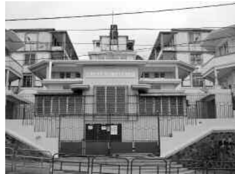
Fig. 2. Lycée Schœlcher seen from the entrance, 1937

Apparently the first modern work in Martinique would have been for the Fort-de-France sailing club in 1927, an unbuilt project by architect Gérard Corbin 1 of Guadeloupe (1905). The first modern building erected was l'Église du Prêcheur, probably built around 1930. A key factor seems to be at the origin of this architecture's development. Through the May 21, 1930 law, the French State allocated 50 million francs to Martinique to repair the damage caused by Mount Pelée's last volcanic explosion in September 1929. 2 Concurrently the Conseil général (Regional Council) raised a public loan of 150 million francs. 3 These efforts materialized as the renewal of many public constructions: town halls in Saint-Pierre (1934), in Grande-Rivière (1932), at Lamentin (1934, Louis Caillat), schools in Basse-Pointe and Bellefontaine