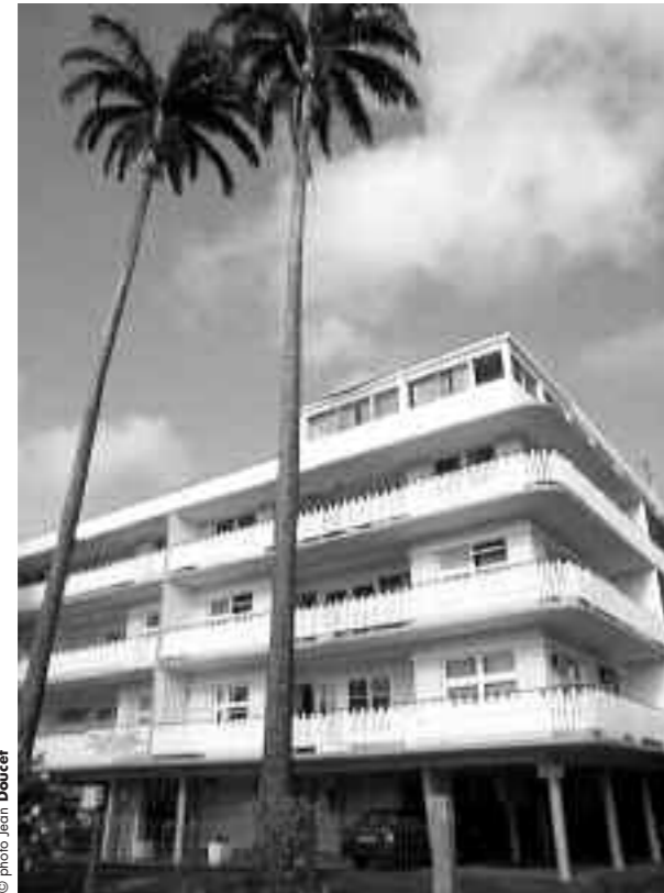
Fig. 10. Lavigne, résidence Les Palmiers, 1960

THE CONSTRUCTION of grands ensembles (large social housing developments) that marked the construction policies of the 1960s, occurred in Martinique at the same time as in continental France. The following are worth mentioning: the Floréal development (Fort-de-France) in 1963, following a block plan by Georges Candilis (1913–1995), 12 Dillon (Fort-de-France) in 1965,