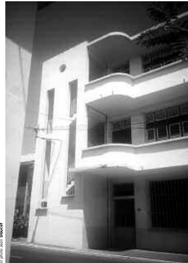
Fig. 1. Basse-Pointe School, 1930s

PART OF THE NINETEENTH CENTURY architecture survives in a confined way, a church here, a market there, with an emblematic example: the Schœlcher library (1889), built following architect Henri Picq's plans. The bulk of extant constructions was realized during the twentieth century when the number of dwellings tripled. In that respect, Martinique is located within the American context although administratively it