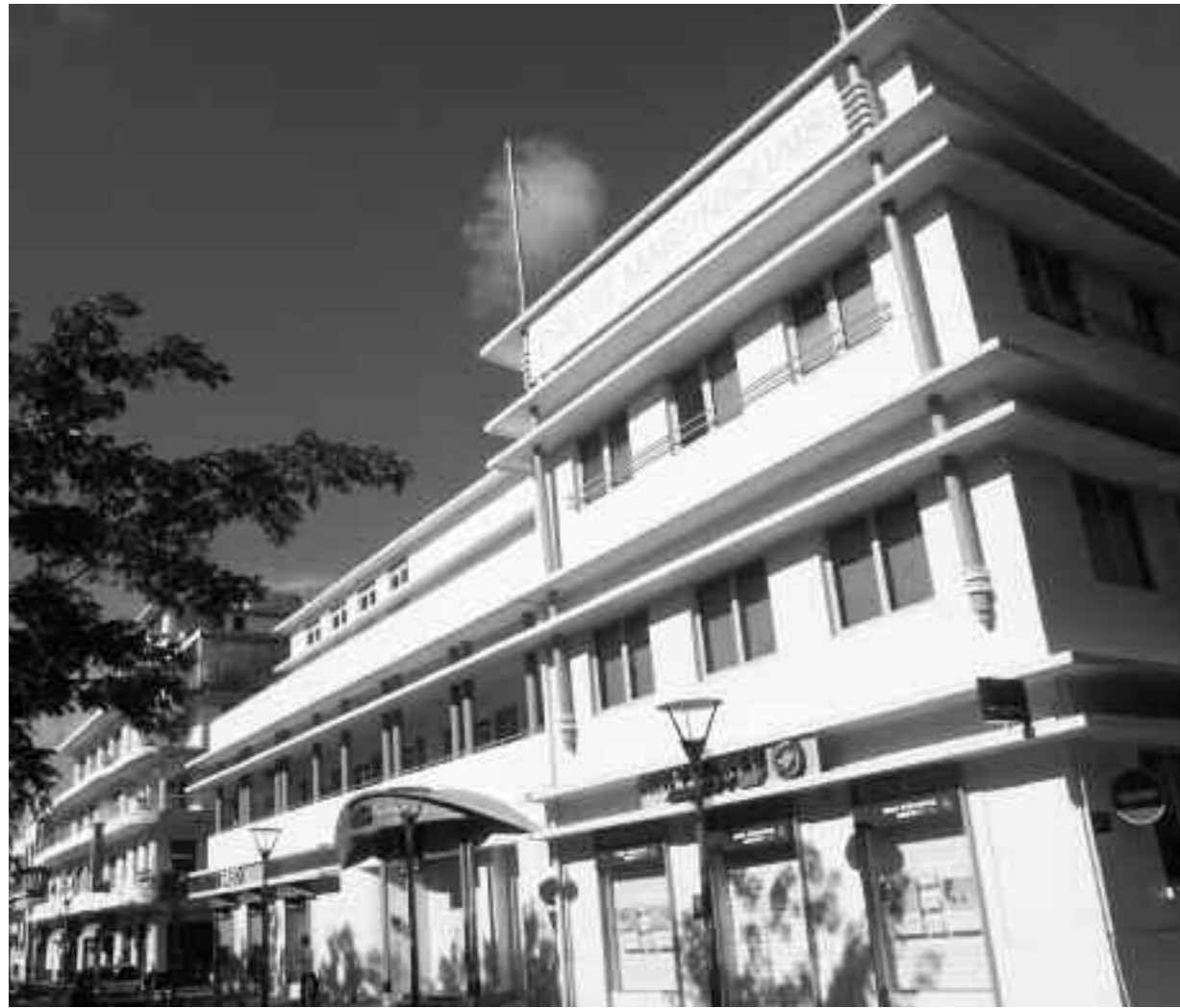
Fig. 13. Building of the former Crédit martiniquais bank after restoration