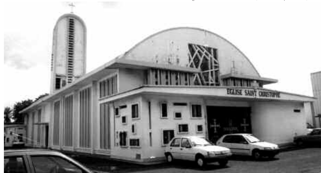
Fig. 11. Tessier and Crevaux, Saint-Christophe church, 1955

makes it possible to create terraces that are very pleasant for the hot hours of the day. In spite of the maritime influence, of the sand's uncertain origin and of the slimness of sections, constructions are often in very decent condition: with little spalling or cracks, doubtless thanks to the concrete's composition that is rich in hydraulic binder. On the other hand, humidity, rainfalls and the relative quality of paints, combined with the absence of upkeep, present the onlooker with many liquid stains, fungal growths and other dirty marks.