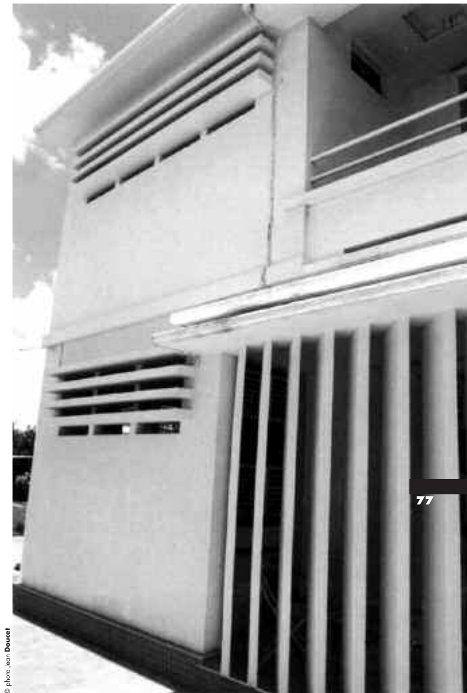
Fig. 12. Rose-Marie-Sanon House, brises-soleil, le Lamentin, 1963