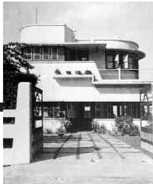
Fig. 6. Louis Caillat, Dormoy house, 1933

THE 1950s see the introduction of collective dwelling projects and the first briefs for middle-class housing