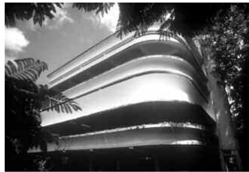
Fig. 8. Louis Caillat, main façades of the Monplaisir House, 1946